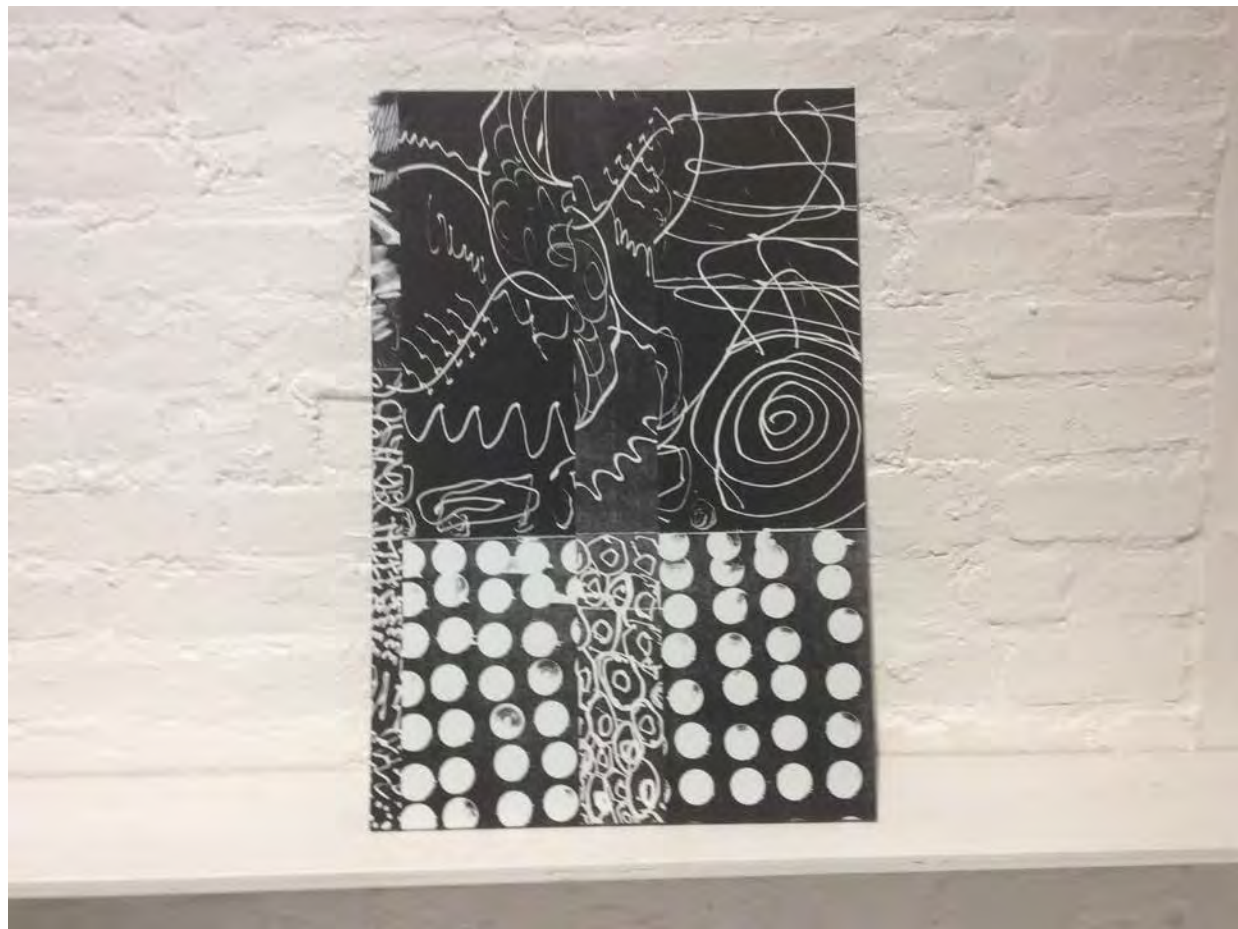
Untitled (CB.05.19) 2019 Front Cover