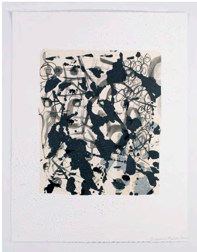
Untitled (CB.27.16) 2016 Handpainted Chine Collé with embossment 29 x 22 in. $6,000