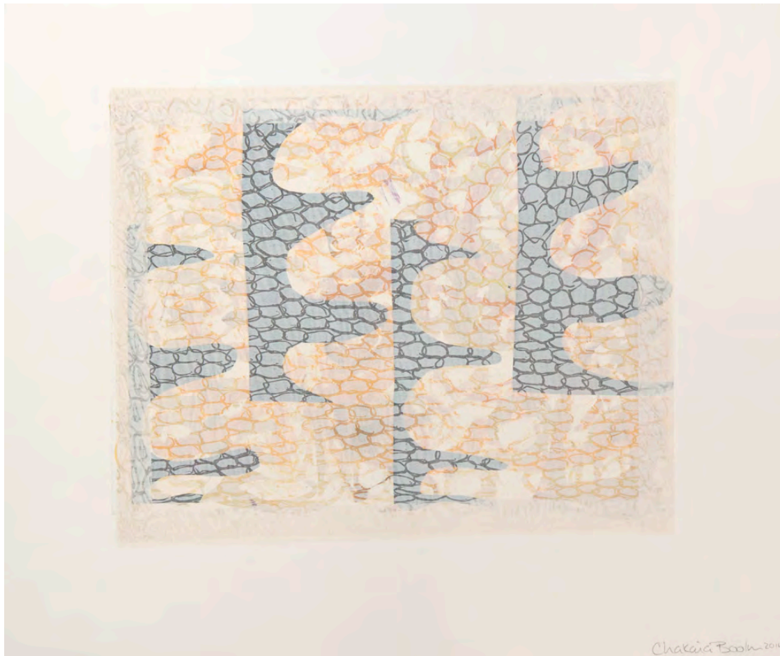
Untitled (CB.55.14) 2014 Woodcut Chine Collé with embossment 19.75 x 24 in. $5,000